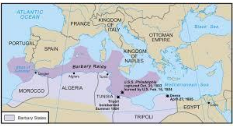
THE BARBARY STATES